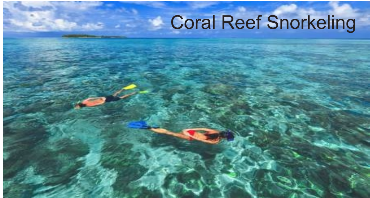
Coral Reef Snorkeling