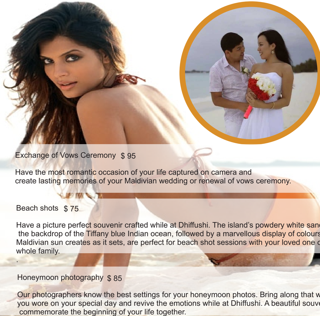
Photo Shoot on the Beach